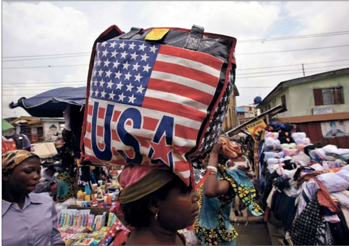
Supporting entrepreneurship can play a pivotal role in combating poverty in the region.

tended that “the business of a businessman is to improve his profits”.